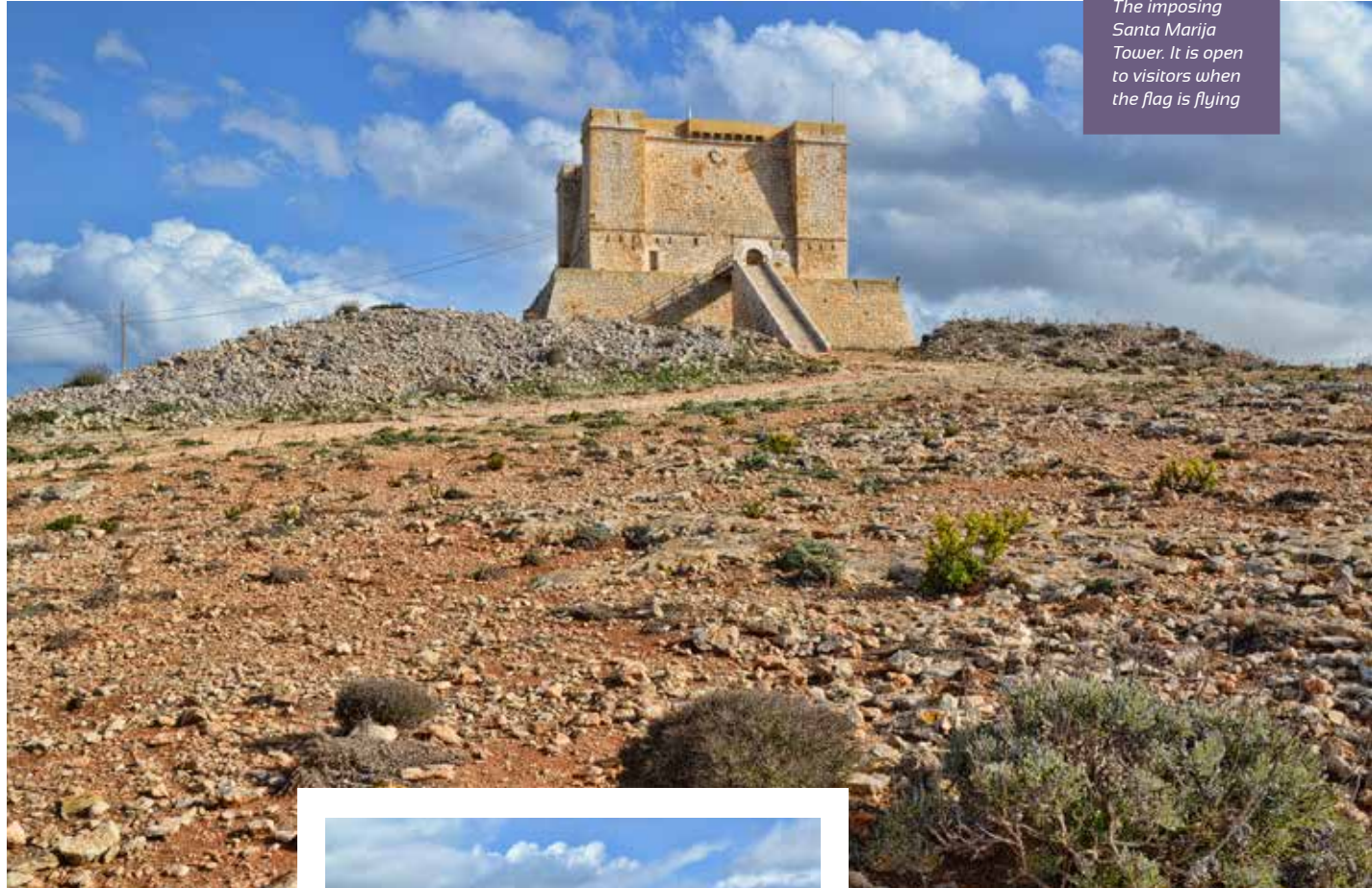
The imposing Santa Marija Tower. It is open to visitors when the flag is flying

which are as yet undated and unclassified but nevertheless interesting as at first glance they resemble ancient rock tombs. Despite the small surface area of the island to date no extensive archaeological survey has been carried out.