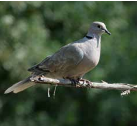
You may encounter the otherwise uncommon Collared Dove

constructed by the Knights to link the Santa Marija Tower with the Santa Marija Battery erected a century later. A small track with a few trees to the right leads down to the small bay of Wied Ernu which used to serve for a while as an unloading jetty.