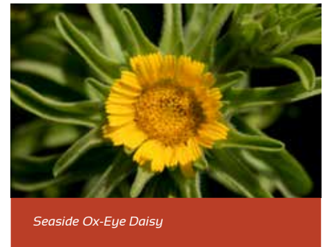
Seaside Ox-Eye Daisy

The road is flanked by a small wood consisting mainly of Aleppo Pine filling the air with its aromatic resinous smell on hot days whilst closer to the ground the yellow-flowered Seaside Ox-Eye Daisy is ubiquitous in Spring. The building to the left is the Old Bakery which currently lies in an abandoned state and ahead on the hillock is the