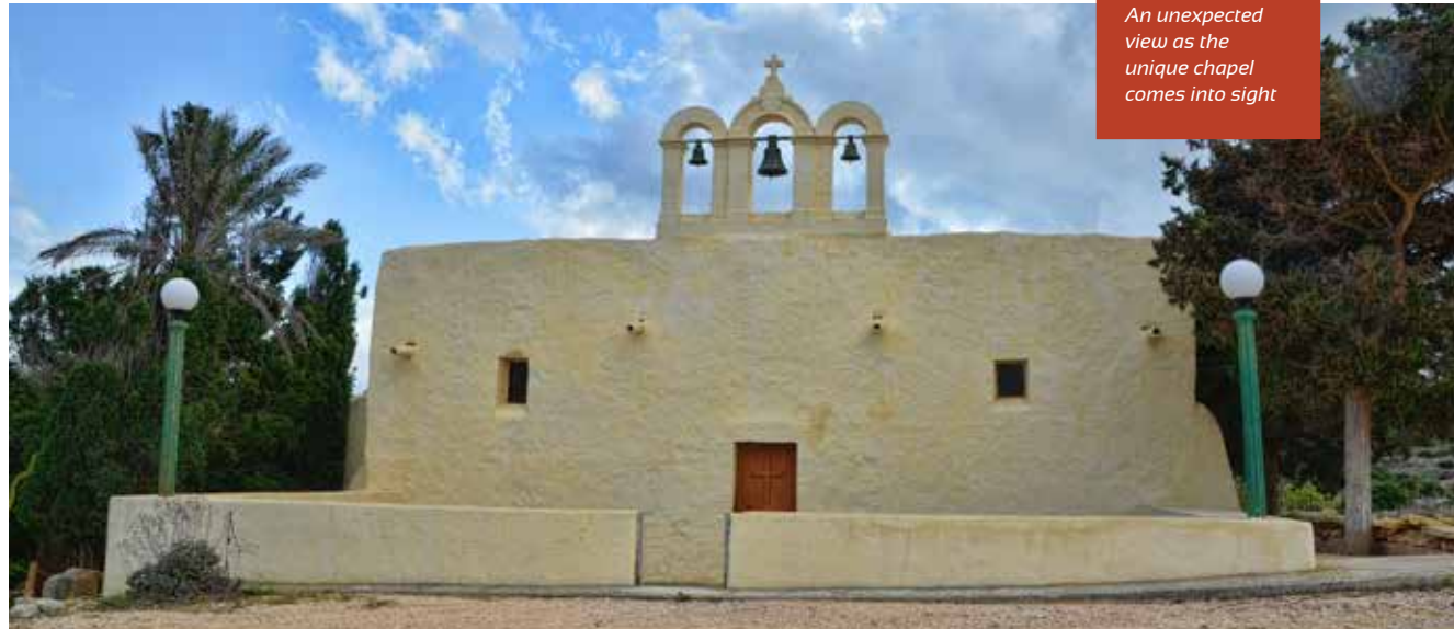
An unexpected view as the unique chapel comes into sight

The return route goes up past the picturesque Santa Marija Chapel dedicated to the Flight of the Holy Family to Egypt — one of the oldest chapels of the islands with quite a unique belfry*.