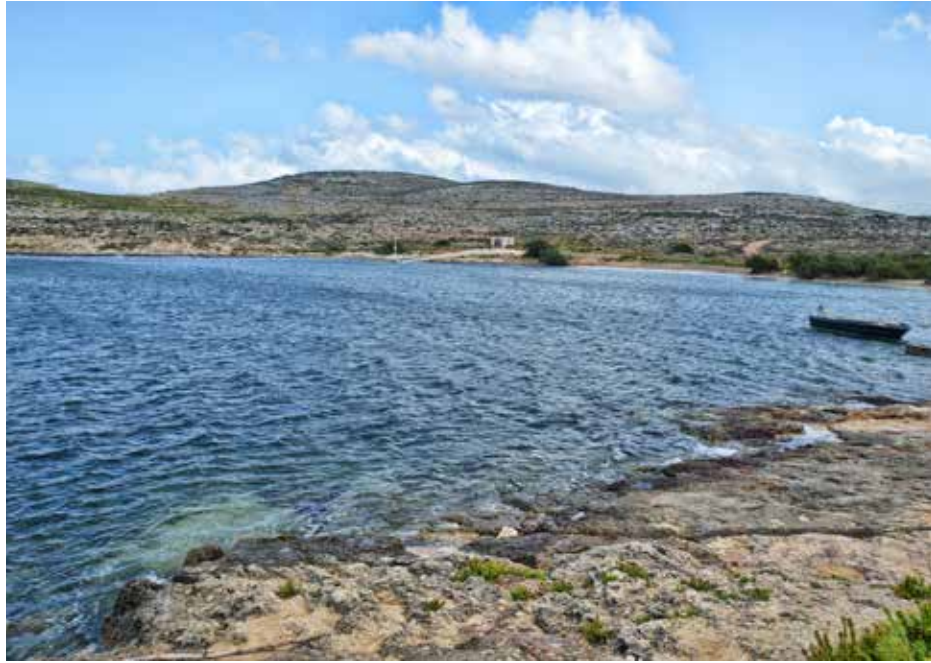
Santa Marija Bay