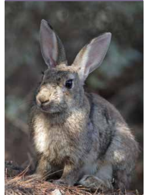
The Wild Rabbit

good hiding place not only for rabbits or reptiles but also, it seems, for soldiers in wartime. Locals remember them posted on guard here in two rock cut chambers excavated in the valley side — features