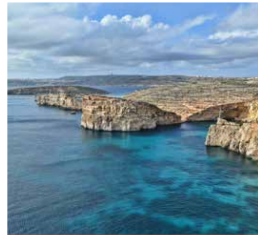
One of the best views – from next to the tower

Best seen from roof of tower is the whole landscape of the island with the highest section rising in the East. A striking feature is the large number of dry stone walls traversing the island — a sign of agricultural activity of the