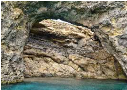
The Roofless Cave

Heading towards the sombre tower crowning the majestic cliffs of Western Comino, the path continues upwards along the cliff. Keeping a safe distance away from the fragile edge do have a look or go down to the crystal clear waters of the next popular spot for pleasure boats — the Crystal Lagoon — known locally as Il-Bejta tal-Fenek (the rabbit’s nest). Indeed the island is renowned for its wild rabbit population which are easier spotted here rather than on the main islands.