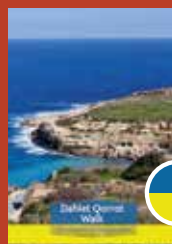
Daħlet Qorrot Walk