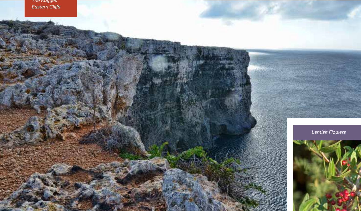
The Rugged Eastern Cliffs