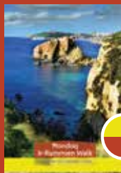
Hondoq Ir-Rummien Walk