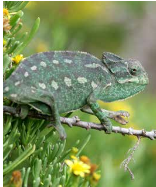
The Mediterranean Chameleon was introduced in the 19th Century

pebble cove - one of the many backdrops to the film the Count of MonteCristo (2002) whose Château d’If was the nearby tower. The narrow promontory of land offers striking views to the tower