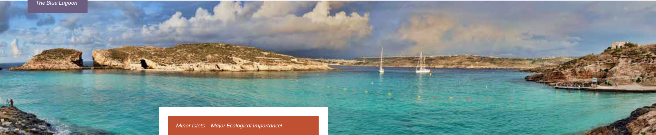
Minor Islets – Major Ecological Importance!