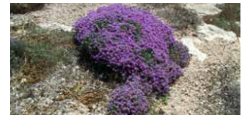
Mediterranean Thyme at the start of Summer

From the battery the route climbs up to go past what used to be an experimental isolation farm*.