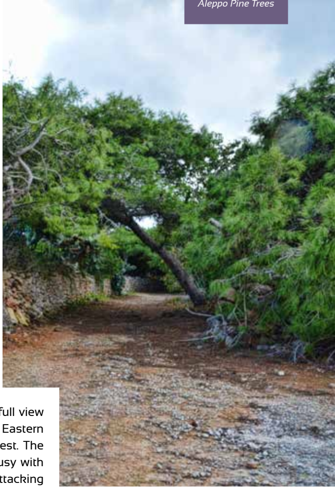
Aleppo Pine Trees

The "tail" of Malta comes into full view guarded by the White Tower on its Eastern end and the Red Tower to the West. The Comino channels were always busy with corsairs, pirates and incursors attacking from all sides so it was necessary to have several coastal forts at close range to drive the message through that the island was well guarded.