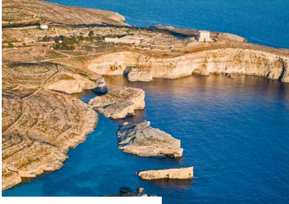
Santa Marija Battery

Continue straight ahead amidst wind sculpted cushion-like shrubs of endemic Maltse Spurge and Olive-leaved Germander holding their ground together with larger shrubs of African Wolfbane. By