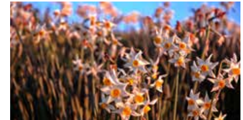
French daffodils briefly scent the air in Autumn