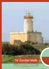
Ta' Ġurdan Walk