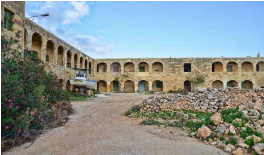
Il-Palazz — the building which once hosted an Isolation Hospital

to land in those islands or approach within 300 yards.” The isolation hospital was fully equipped and manned to deal with eventualities, which in reality rarely arose. The hospital now lies in large part abandoned.