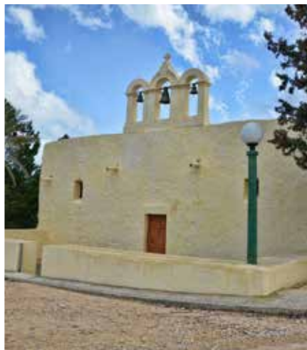
Simple but unique – the only chapel on Comino

2 The small chapel lies on the St Mary's Tower/Qala Santa Marija road. It is dedicated to the Flight of the Holy Family to Egypt. It dates from the early 16th century as is shown by its architecture and more significantly its wooden screen separating the officiating priest from the congregation – a feature which was present in rural chapels from which the original wooden screen has disappeared.